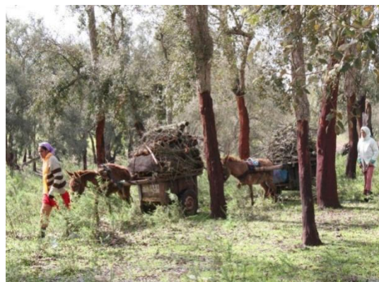
Photo1: Harvesting of wood by rural women

It is an activity essential to meet the fuel needs of the household. Indeed, the wood collected is used for heating in cold weather, for baking bread and meals ...etc. The amount of wood collecting and frequency of travel vary by season, household needs and the proximity of the forest. These are virtually the women and girls out of school first that handle this task.