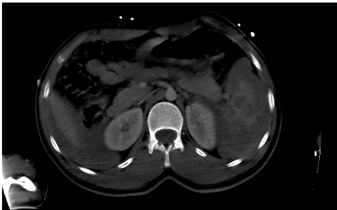
Figure 1. Grade IV spleen laceration

The most common complications encountered in patients undergoing splenectomy due to trauma or liver repair are wound infection, pneumonia, sepsis, and ARDS. Non-operative follow-up of patients with blunt abdominal trauma reduces the duration of hospital stay as well as protecting the patient from the possibility of postoperative complications (27,28). In this study, the duration of hospitalization of the patients who were followed-up without surgery was found to be significantly lower. On the other hand, the most common complications are bilioma, pseudoaneurysm and intra-abdominal abscess in patients with non-operative follow-up (29,30). In this study, no complication was detected in the patients without surgery who were followed up, and 4 of the operated patients developed an infection