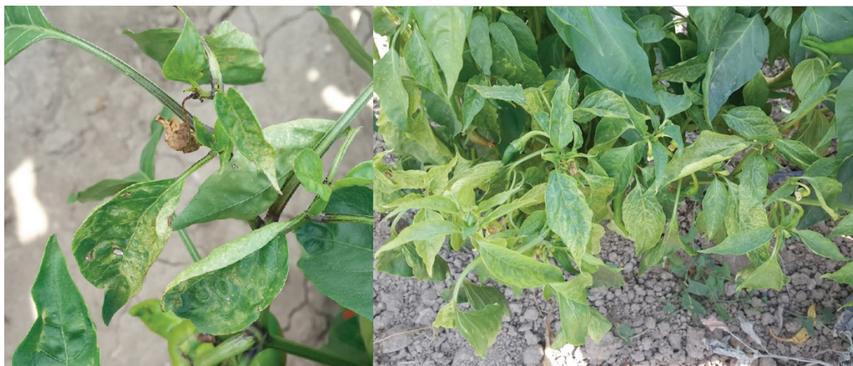
Figure 1. Symptoms on infected plants collected during surveys

Pepper ranks second after tomato in terms of vegetable cultivation and vegetable production is an important source of income for farmers. Previously, pepper leaf samples were collected from pepper growing areas Tokat Central, Turhal, Pazar, Erbaa and Niksar districts of Tokat in July-August 2016. During the surveys, typical TSWV symptoms