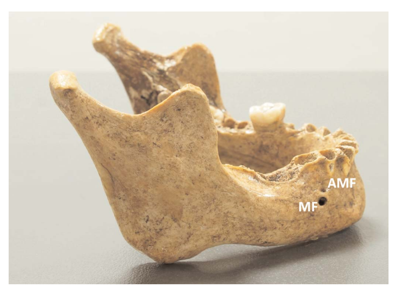
Figure 1. The mental foramen (MF) and accessory mental foramen (AMF) in a mandible.

Eleven (15.71%) accessory mental foramens were detected in 35 mandibles (70 sides) ( Figure 1 ). Six (54.55%) of the accessory mental foramens were on the left side, and 5 of