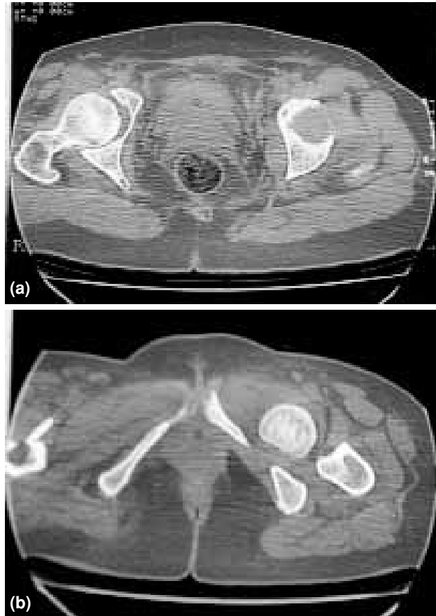
Figure 2. CT scans of obturator type anterior dislocation of the hip on the left side. (a) Empty acetabulum and (b) anteriorly displaced femoral head to the region near obturator foramen

control of the patient at October 2001 that range of motion was close to normal except the internal rotation at right hip joint. And patient stated that she can do inside and outside activities without any restriction or assistance.