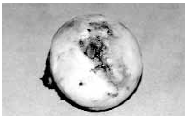
Figure 3. Cartilage defect of the femoral head extracted in the operation.