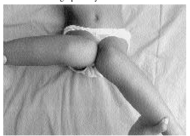
Figure 3. It is evident that the right hip could have an internal rotation(42)(of) up to 90 degrees in a view taken two months after the reduction of the recurrent dislocation.

During the physical examination conducted two years and six months after the last dislocation when the patient was six years old, it was observed that the over-activity of the internal rotation in the right hip and the difference of internal rotation between the two hips had disappeared, and no symptom was found (Figure 4a, b). There was no finding suggesting hyperlaxity during the physical examination. Her genetic history revealed that her mother, grandmother, five aunts and sister of her grandmother had bilateral developmental displasia of the hip. It was confirmed radiographically in her mother.