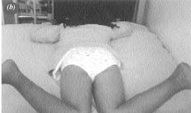
Figure 4. It is evident that there was no difference between the internal rotations of the two hips in views taken when she was lying (a) on her back and (b) face downward.