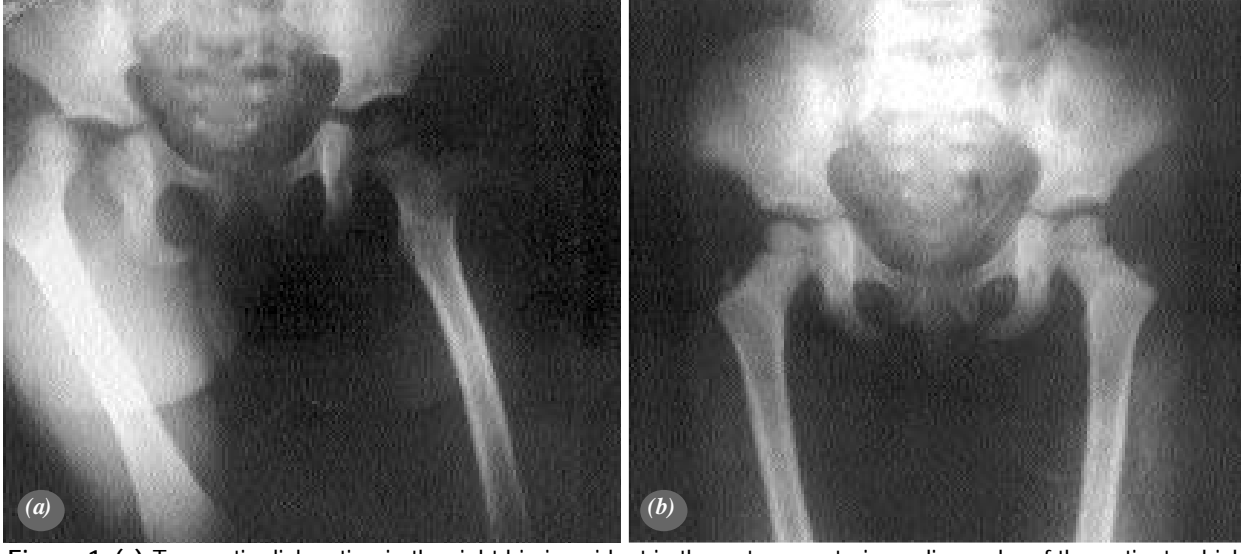
Figure 1. (a) Traumatic dislocation in the right hip is evident in the antero-posterior radiography of the patient, which was taken when she was two years old. (b) The antero-posterior pelvis radiography following the reduction in the first occurrence of dislocation.

Due to the recurrence of dislocation, conventional arthrography was planned under general anesthesia after taking her parents' approval; but they didn't permit it. During the physical examination at the beginning of the post-reductive third month, an internal rotation with 90 degrees was observed, which made us consider posterior capsular laxity in the right hip. There was a difference of 45 degrees of internal rotation between the two hips (Figure 3). Later on, no pathological finding was found to indicate avascular necrosis, capsular extension, osteocondral lesion, soft tissue interposition, diversion or