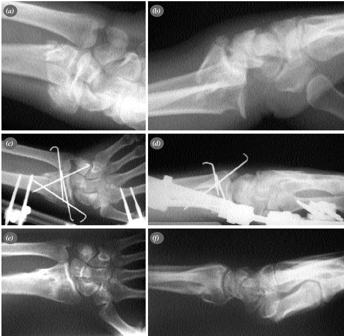
Figure 1. (a, b) Anteroposterior and lateral radiographs of a patient who suffered from a traffic accident. (AO type C2) (c, d) Early post-operative radiographs. (e, f) Anteroposterior and lateral radiographs on 25th month. (g, h) Clinical appearance of patient after physical therapy.

Active finger ROM exercises were initiated on the day after surgery. Supination and pronation exercises were started after two weeks. After the fixator removal no limitation of exercises were done. Meanwhile a dynamic splinting program was applied to patients who had pronation-supination