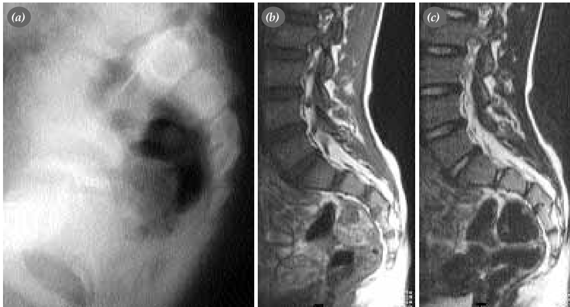
Figure 2. (a) Lateral radiography of the pelvis two years after the trauma, and (b, c) T2- weighted sagittal magnetic resonance images reveal complete union of the fracture.