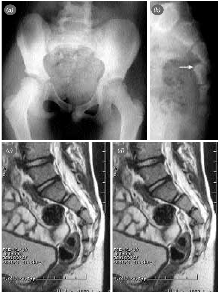
Figure 1. (a) Anteroposterior and (b) lateral radiographs of the pelvis. Type II epiphysiolysis according to the classification by Salter-Harris is evident in the third sacral vertebra, disintegrated with an anterior displacement, which was not evident in the anteroposterior radiography. (d, e) The T 2 -weighted sagittal magnetic resonance images reveal type II epiphysiolysis in the third sacral vertebra. No stress is observed on the neurological structures.

No stress was observed on the neurological structures. Patient didn't undergo rectal surgery for reduction; he was included in the follow-up program of the polyclinic after discharged from the hospital for bed-rest following two days of observation. At a three-months follow-up, his complaints were all relieved and his gait was improved. He had no complaints at a two-years follow-up; radiographic evaluation (Figure 2a) and MRI (Figure 2b, c) revealed full union of the fracture, and no stress was found on the neurological struc-