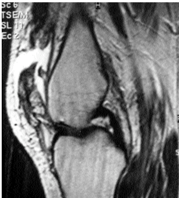
Figure 2. The rupture of tendon of quadriceps at the site of adhesion to the patella in MRI.

while stretching the tendon. The motion and rotation of patella were evaluated by positioning the knee at flexion (figure 3b). Lateral and medial retinaculums were repaired by no.5 nonabsorbable strings. After closing subcutaneous tissues and skin, casting was performed for 6 weeks while knee was at full extension.