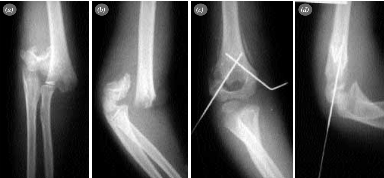
Figure 1. Left type III supracondylar humerus fracture in a 6 year old child radiographs a) pre operative AP and b) lateral. Radiographs taken 4 weeaks after ORIF by medial approach c) AP d) lateral

cance (_) was set at .005. The study had a power of 95% to yield a statistically significant result should a true difference exist between the groups.