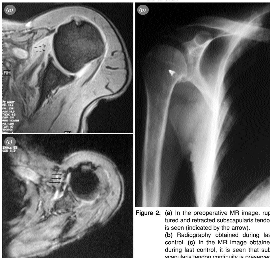
Figure 2. (a) In the preoperative MR image, ruptured and retracted subscapularis tendon is seen (indicated by the arrow). (b) Radiography obtained during last control. (c) In the MR image obtained during last control, it is seen that subscapularis tendon continuity is preserved.

5 of the 6 patients stated that pain that they suffered before surgery was alleviated during their last controls. 1 of the patients stated that he had a pain which required analgetics and is constant but possible to bear.