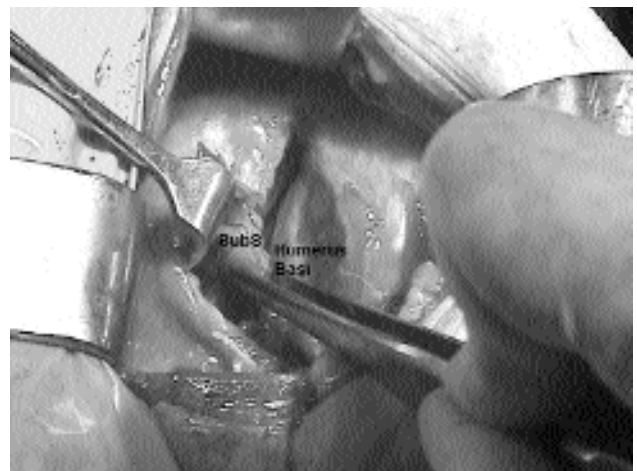
Figure 1. Appearance of subscapularis tendon tear

Perioperatively, any complication wasn't observed. A patient was treated due to a cerebrovascular incident occurred on the second postoperative day.