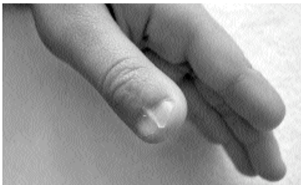
Figure 1. The nail deformity after the Bilhaut-Cloquet procedure

Bifid thumb anomaly is the one of the most common congenital upper extremity anomalies. The thumb is growing about the mesenchymal condensation of the radial sided hand pedicle. Duplication