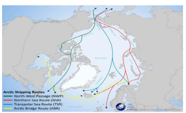
Fig. 1. North Pole Routes (Arctic Institute, 2014)

The Transpolar Sea Route is an Arctic shipping route that runs from the Atlantic Ocean through the center of the Arctic Ocean to the Pacific Ocean. It is also called the Trans-Arctic Route. The TSR passes outside the