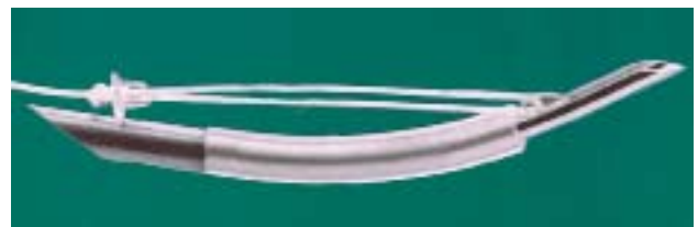
Figure 1. RapidLoc device

The meniscal repairs of all the patients were carried out using RapidLoc device (Mitek, Westwood, MA) (Figure 1). To optimize healing an arthroscopic rasp was used on both the superior and inferior parameniscal capsule. The implant is preloaded onto a needle. There are three available needle angles (0°, 12°, and 27°). The delivery needle was passed through the meniscal tear to the pericapsular soft tissue by the help of the applier (a gun shaped device) and the trigger on the applier was pulled to open the backstop. The suture was then pulled to ensure the fixation of