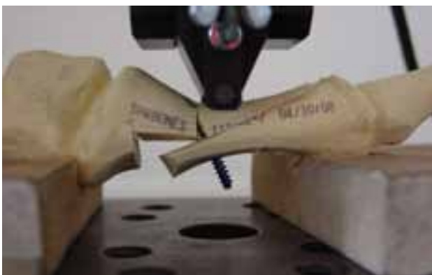
Fig. 2. Assembly of the three-point bending test and failure of the new modification of the Mau osteotomy.

The mean stiffness of the Ludloff osteotomy was significantly lower than all the other groups ( p < 0.05 ). Stiffness of the Mau group was significantly greater than other groups except for the offset V group ( p < 0.05 ).