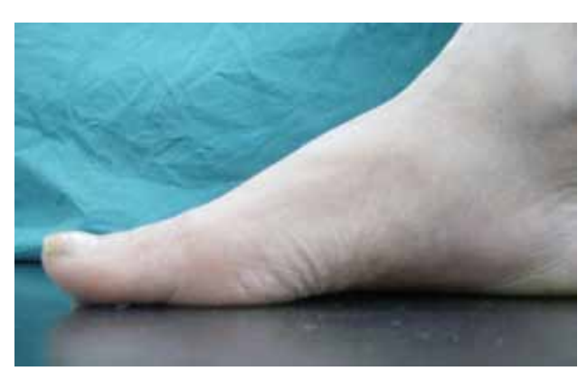
Fig. 3. Postoperative appearance of a big toe showing loss of ground contact.

While arthrodesis is the standard treatment in grade 3 and 4 hallux rigidus, it is mainly performed in cases with recurrent hallux valgus deformity, instabilities after failed surgeries, and advanced degenerative arthritis in the MTP joint. [4,7,9,12] Arthrodesis restores the weight distribution in the first row of the foot, and maintains normal transfer of weight to the big toe while walking. Pedobarographic measurements and gait analyses have shown that arthrodesis provides a more normal plantar pressure pattern.[16,22,23] However, despite these advantages, arthrodesis is a more difficult technique compared with the others and requires bone-to-bone healing