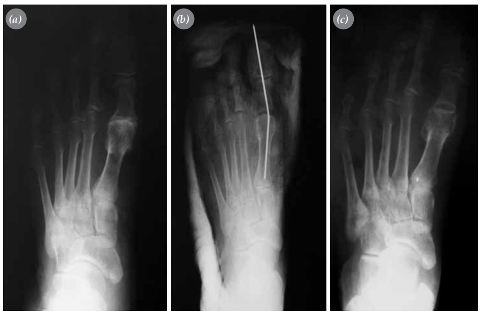
Fig. 1. Radiographs of a patient with hallux rigidus. (a) Preoperative view, (b) postoperative view at 2 weeks, (c) postoperative view at 2 years.

had bilateral involvement. According to the grading system developed by Coughlin and Shurnas (Table 1), [6] 18 feet were grade 3, one was grade 4. Preoperative and postoperative radiographic assessments included standing anteroposterior and lateral X-rays to measure the joint space width of the first MTP joint, hallux valgus angle, and intermetatarsal angle (Fig. 1). For subjective evaluation, the patients were asked to rate their postoperative satisfaction level as very good, good, moderate, or poor. Clinical evaluations were made using the AO-FAS (American Orthopaedic Foot and Ankle Society) hallux metatarsophalangeal-interphalangeal scale.[19] In this scale, pain, function, and anatomical structure of the joint are scored with maximum points of 40, 45, and 15, respectively, where total scores of ≥90, 80-89, 70-79, and 0-69 points show excellent, good, fair, and poor results, respectively. The mean follow-up period was 21 months (range 9 to 32 months).