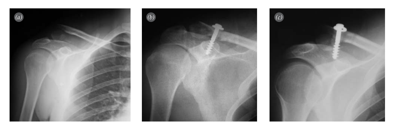
Fig 3. (a) Radiograph of a Type 2 distal clavicle fracture after a falling injury. (b) Postoperative radiograph after screw fixation. (c) Follow-up radiograph one month later shows the failure of the fixation.

During follow-up, we had an implant failure in one patient (Fig. 3). This patient had difficulties in cooperation due to mental retardation. Therefore, the screw was removed and the fracture was left to heal on its own. Union was observed in the fracture at approximately Week 10. The follow-up at Year 2 showed that the distal end of the clavicle healed with deformity (Fig. 4). Despite this deformation in the fracture line, the patient had a full range of motion (Fig. 5). He had no pain during shoulder exercises. No postoperative complications were observed.