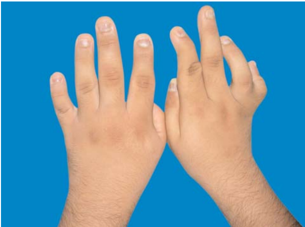
Fig. 1. Dorsal view of the hand, showing the flexion deformity of the index finger on the right hand and syndactyly of the little and ring fingers. [Color figure can be viewed in the online issue, which is available at www.aott.org.tr ]