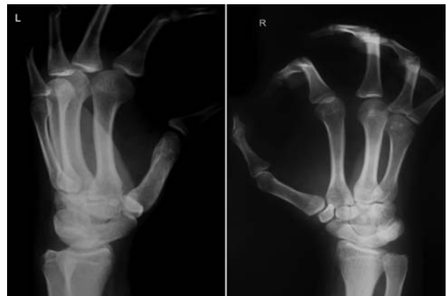
Fig. 4. Oblique view of the wrist showing the coalitions.