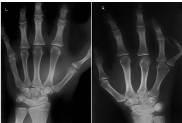
Fig. 3. Posteroanterior radiograph of the hands, showing the SLTC on the left and SLC with absent fifth ray on the right.

Unless syndrome related, carpal coalitions are usually an incidental finding. However, carpal coalitions may become symptomatic. Since there is no possibility of movements of the fused bones, pain may be caused by increased compensatory movements of the adjacent joints and soft tissue. [1,2] In incomplete coalition, because of the absence of intra-articular cartilage, there is a likelihood of degenerative arthritis due to stress loading. [3] Occasionally, patients may present with fracture of