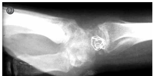
Fig. 4. The same patient's long-term follow-up (a) anteroposterior and (b) lateral radiographs.