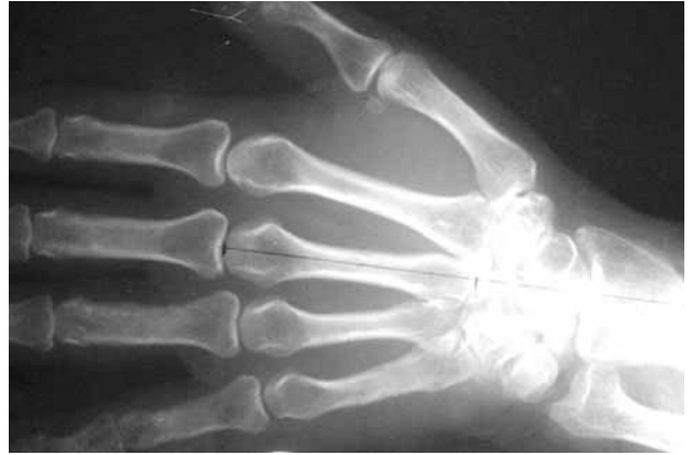
Fig. 3. Preoperative anteroposterior radiograph of a Stage 3a patient and drawings to determine the carpal height ratio.

The failure to maintain carpal height following lunate excision, and the development of arthrosis as a result of carpal collapse are the major criticisms related to this surgical method. Sakai et al. [11] applied lunate excision in two groups of patients. The first group was treated with replacement of the lunate with a palmaris longus tendon graft with a bone core placed in the tendon ball and the second group was treated with replacement of the lunate with a palmaris longus tendon graft without a bone core. The authors emphasized that at the end of the first postoperative year, the tendon ball with the bone core maintained carpal height while carpal height was significantly decreased and the rate of arthrosis development was significantly higher in the non-bone core group. However, there was no significant difference between the two groups with respect to the clinical outcomes despite the presence of carpal collapse.