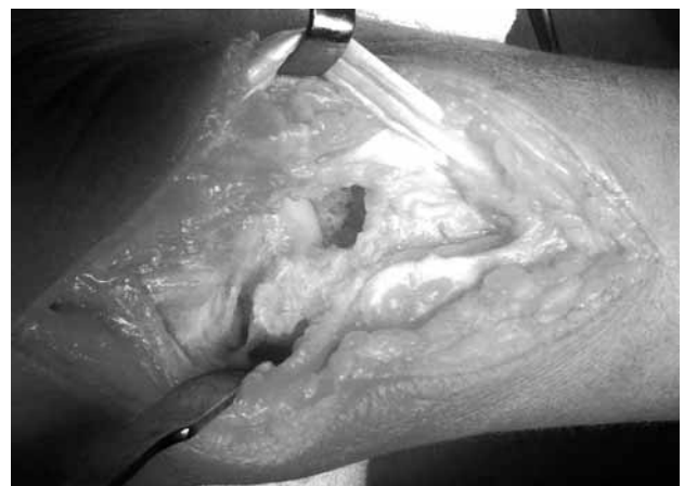
Fig. 1. Operative image after excision of the lunate bone.

In the clinical evaluation, joint range of motion was assessed using goniometric measurements, grip strength was evaluated with a dynamometer, and functional outcomes were assessed using the system developed by Nakamura et al. [20,21] The carpal height ratio (the ratio of the distance between the distal articular surface of the capitate and the distal articular surface of the radius to the length of the third metacarpal on a posterior-anterior radiograph) and revised carpal height ratio (the ratio of the distance between the distal articular surface of the capitate and distal articular surface of the radius to the longest axis length of the