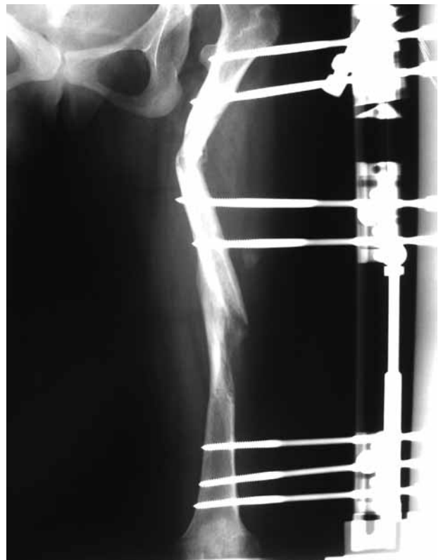
Fig 3. Pelvic support osteotomy using monolateral external fixator in a patient with hip instability due to congenital dysplasia of the hip.