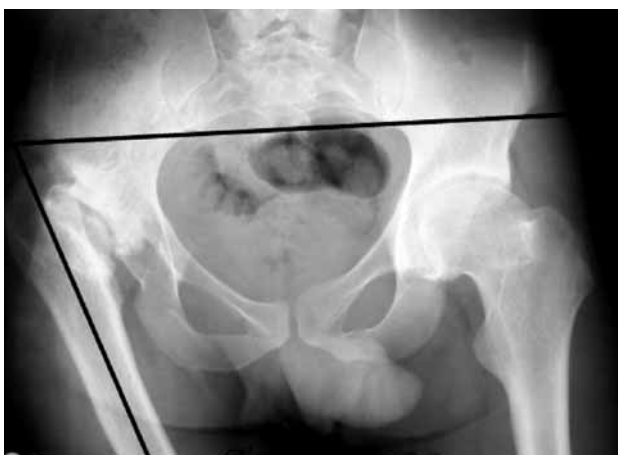
Fig 1. Pelvis AP X-ray with unstable hip in maximum adduction.

AP pelvis X-rays were used to determine etiological factors and measure the proximal migration of