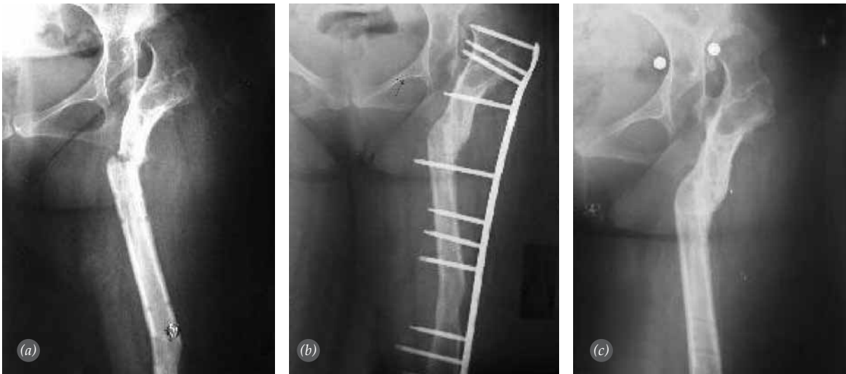
Fig 6. (a-c) Fracture at the proximal osteotomy site after removal of external fixator. The fracture was fixed by locking plates and union was achieved.

Femoral head resection is an improvement of pelvic support osteotomy described by Milch. [25,27] Inan et al. performed femoral head resection for all of their patients [25,26,28] whilst Kocaoğlu et al. performed resection for three patients with pain in their neocotyles. [23] Schiltenwolf et al. reported satisfactory results in patients with congenital dysplasia of the hip for whom they performed subtrochanteric valgus osteotomy and no resection of the femoral head. [29] In our study, femoral head resection was only initially performed in one patient in the 26th postoperative month who experienced persisting pain.