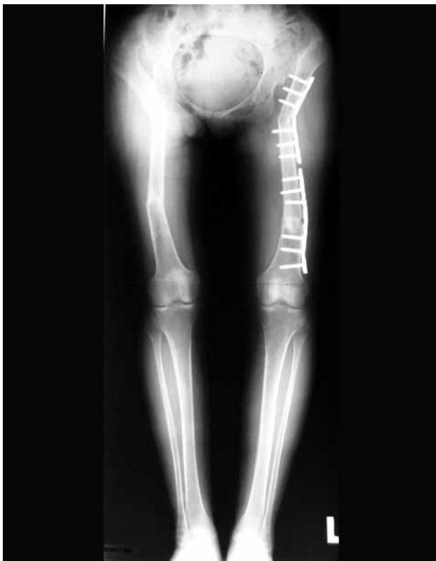
Fig 2. Final orthoroentgenogram of the patient with no limb length discrepancy. Lengthening was not made and the osteotomy sites were fixed using locking plates.

Mean external fixation period for all 19 patients who received external fixators was 362.2 (range: 147 to 623) days. It was a mean of 415.4 (range: 270 to 623) days for patients with monolateral external