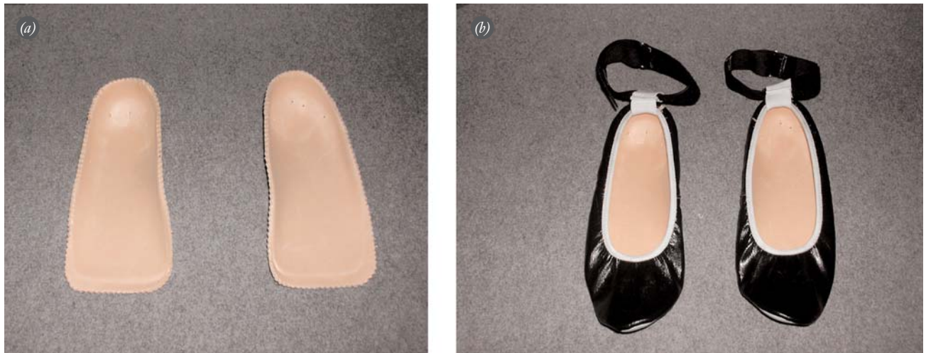
Fig. 1. (a, b) Final views of the custom-made insole. [Color figure can be viewed in the online issue, which is available at www.aott.org.tr ]

retro-reflective markers were placed onto the anatomic landmarks of both the lower extremities at the following points: anterior superior iliac spine, posterior midline of the pelvis, thigh, knee, mid-tibia, ankle, and second metatarsal (Fig. 2).