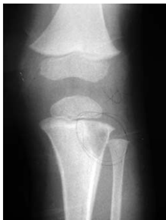
Fig. 1. Lytic lesion located at the metaphyseal region of the proximal tibia.