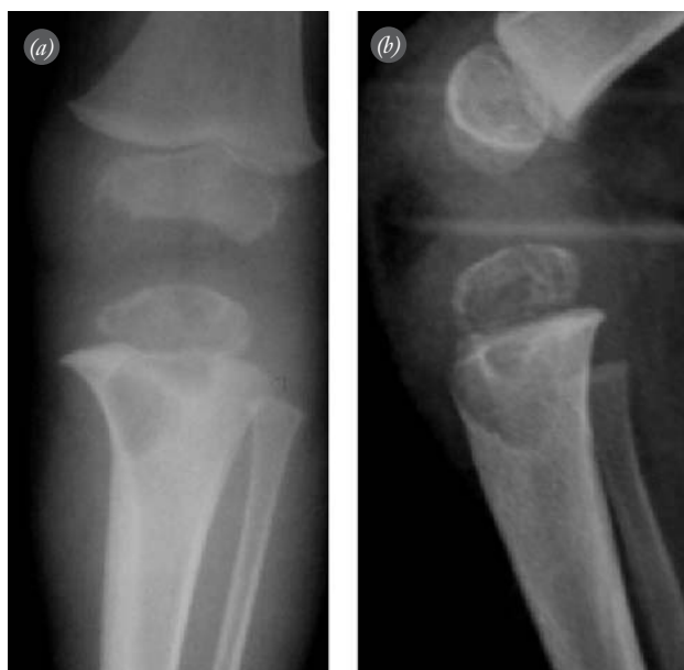
Fig. 4. (a, b) Lytic lesion located at the metaphyseal and epiphyseal region of the proximal tibia, disrupting the growth plate in Patient 2.