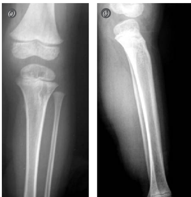
Fig. 3. (a, b) Size of the lytic lesions decreased in the 13th month follow-up view of Patient 1.

Before the antibiotherapy commenced, the patient applied to our clinic. Computerized tomography (CT) scan and magnetic resonance imaging was performed. Radiological evaluations revealed osteolytic lesions disrupting the growth plate containing calcified foci located at both the metaphyseal and the epiphyseal region (Figs. 5 and 6). We performed a tru-cut biopsy of the osteolytic lesions and tuberculosis infection was verified