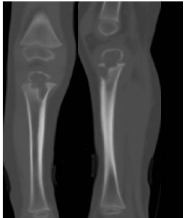
Fig. 6. Lesions disrupting the growth plate at CT scan.

the bone. [1-3,11-14] Identification of Mycobacterium tuberculosis with culture is a lengthy process, causing delay in the accurate diagnosis. Chen et al. reported an average delay in the diagnosis of tuberculous osteomyelitis of 6.6 months. [14] Due to clinical presentation, these cases should be evaluated and diagnosed on an emergency basis. Tru-cut biopsy and histopathological evaluation are more useful for early diagnosis. [3,4] Histologically, the existence of a necrotizing granulomatous inflam-