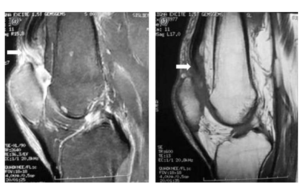
Fig. 1. (a, b) Appearance of the ruptured quadriceps tendon (arrow) in MRI sections of the second patient.

Under general anesthesia, pneumatic tourniquets were applied at the level of the thigh. A 15 cm longitudinal incision was made from the inferior pole of the patella and extending upward. Following hematoma drainage and tendon debridement, a groove was made on the upper patellar pole. Three longitudinal tunnels