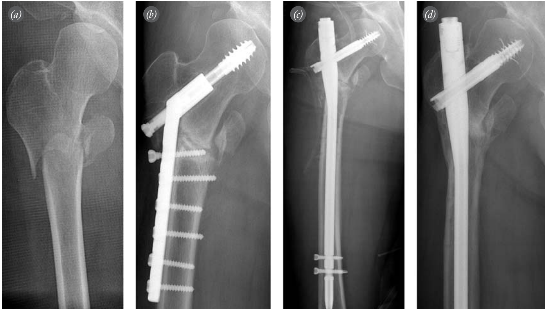
Fig. 1. Antero-posterior view of a subtrochanteric fracture (a) in a 44-year-old male patient involved in a traffic-accident. Antero-posterior radiograph (b) shows atrophic nonunion 11 months after internal fixation with a CHS. (c) CHS was removed and a cephalomedullary nail was applied with autogenous bone graft. (d) Radiograph shows a union 6 months after the revision.

would be exchanged in treatment of subtrochanteric nonunion by our criteria. In case of failure in the previous retaining surgery, reduction loss of metallic failure, significant shortening or large bone defect, we exchanged the previous hardware. On the other hand, when the bony defect was small or there were none of the above mentioned indications, we tried to retain the implant. As already known, the most optimal device for treatment of subtrochanteric nonunion has not been defined yet. We decided the type of implant to be used