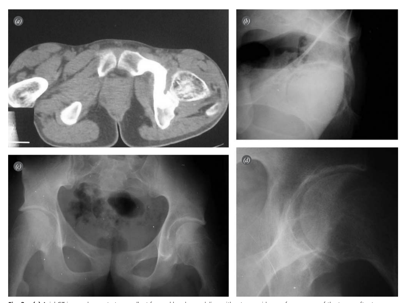
Fig. 3. (a) Axial CT image demonstrates excellent femoral head remodeling without any evidence of recurrence of the tumor after ten years. (b-d) Last pelvic X-rays of the case demonstrate femoral head remodeling and a normal hip joint space.

The intraarticular part of the acetabulum is a relatively common site for osteoid osteoma when compare with osteoblastoma. [10,11] Several cases of intraarticular lesions are difficult to identify. A focal lesion may not be detected even after the onset of symptoms and radiological identification of the tumor. Bone scintigraphy and computed tomography are essential for an accurate and early diagnosis. These imaging techniques reveal abnormalities in bone and cartilage growth, new bone formation and sclerosis distant from the tumor on other site of joint and disruption of the articular surfaces.