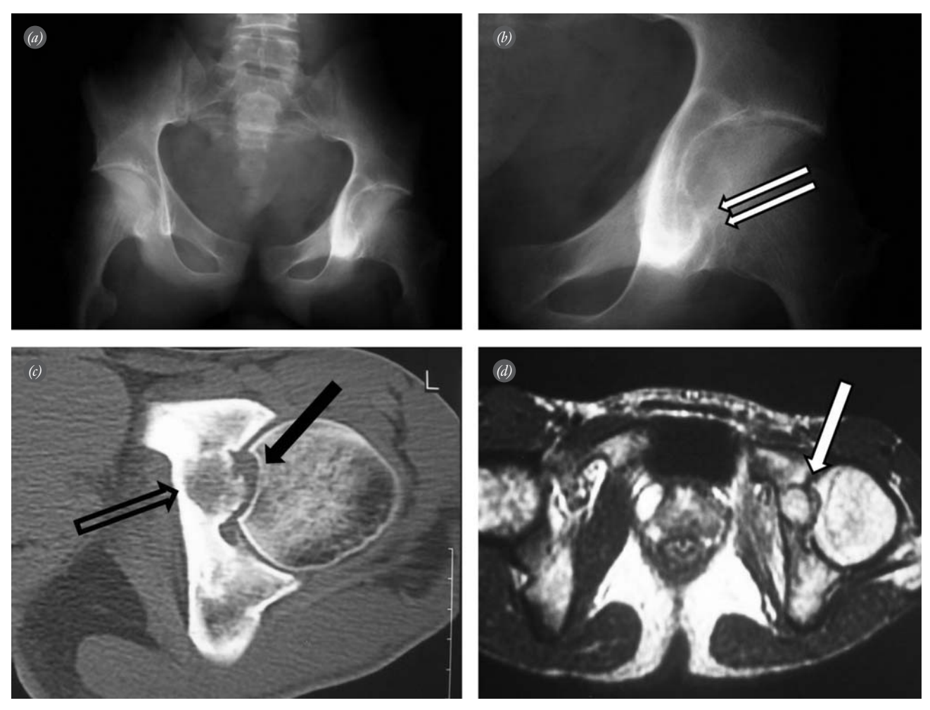
Fig. 1. (a) Anteroposterior pelvic X-ray represents the sclerotic lesion on left acetabular site. (b) White arrows show the gap due to impingement of lesion on femoral head. Axial CT image (c) demonstrates intraarticular expansile lesion (outlined arrow) and femoral head destruction (solid black arrow). (d) Magnetic resonance imaging of the lesion also shows the soft tissue edema.

1d). Bone scan with technetium<sup>99</sup> phosphonate showed an increased uptake in the left pelvic ring.