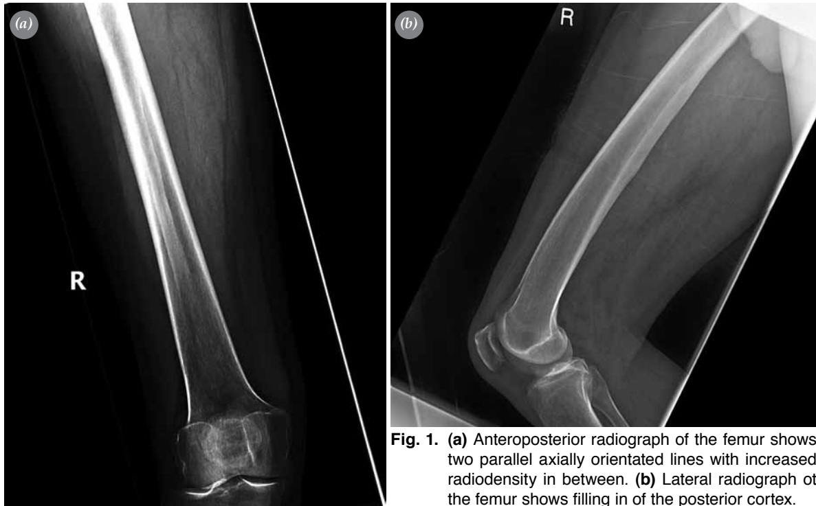
Fig. 1. (a) Anteroposterior radiograph of the femur shows two parallel axially orientated lines with increased radiodensity in between. (b) Lateral radiograph of the femur shows filling in of the posterior cortex.

oral diaphysis (Fig. 1). These findings were identified as a possible 'flame' sign associated with Paget's disease and the patient was further investigated with an isotope bone scan. The scan showed no evidence for active Paget's disease or any other significant osteoblastic pathology, but mildly increased tracer uptake in both shoulders and the right hip, likely to be due to osteoarthritic changes (Fig. 2). A subsequently performed magnetic resonance scan showed no localized soft tissue or bone abnormality in the thigh but arthropathy in the right hip joint. Based on the negative investigations for Paget's disease or a bone pathology, the lesion in question was identified to be a track sign.