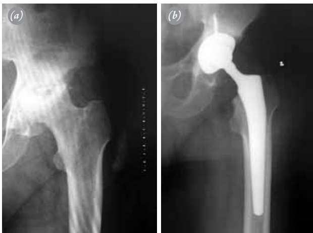
Fig. 1. (a) Preoperative and (b) postoperative radiographs of the patient.

ultrasound, radiography, MRI (Fig. 2a) and angiography (Fig. 2b) showed a pseudoaneurysm of the left femoral artery, spreading proximal to the left common iliac artery. Laboratory findings were normal. There were no signs of anemia or bleeding tendency.