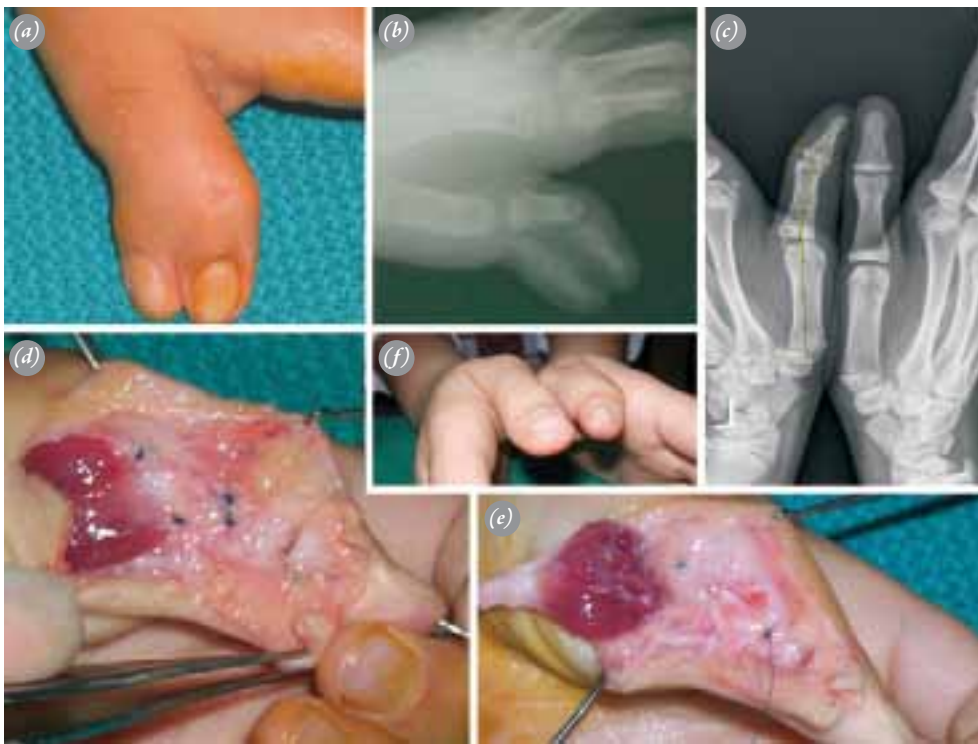
Fig. 1. (a) Clinical view of left hand thumb duplication. (b) Radiological view of left hand thumb duplication. (c) Radiological view of the affected thumb in the last control. There is more than 20 degree interphalangeal joint instability. (d, e) Operative view. After ablation of radial sided thumb, radial collateral ligament and abductor pollicis brevis reinsertion were performed. (f) Clinical view in the last control. [Color figure can be viewed in the online issue, which is available at www.aott.org.tr ]

The aim of this study was to review the results of patients with Wassel type IV thumb duplication, treated with a single reconstructive procedure.