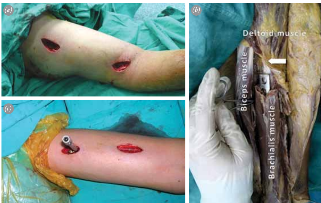
Fig. 1. (a) Proximal and distal incisions for MIPPO. (b) The brachialis muscle covering distal half of the anterior humeral surface, through which the plate is advanced and the detached anterior deltoid insertion (white arrow), to facilitate both plate advancement and positioning. (Cadaver dissection). (c) The threaded drill guide is engaged to the locking plate to help positioning. [Color figure can be viewed in the online issue, which is available at www.aott.org.tr ]

In all cases, acceptable alignments were maintained by reducing the main fragments. All fractures had successful union without deep infection or wound complication (Fig. 2). Two patients had superficial wound infections which were controlled with antibiotic therapy. One