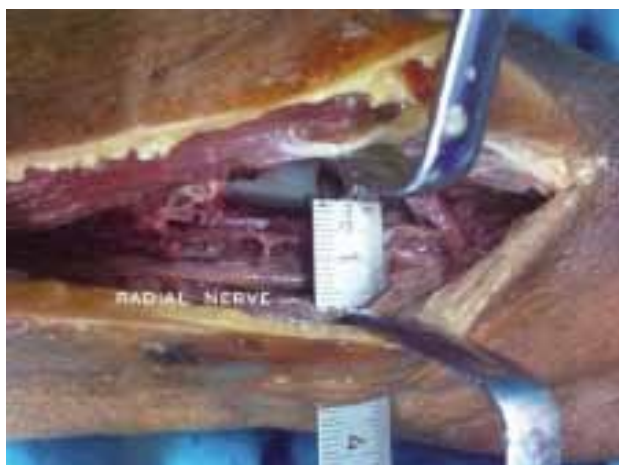
Fig. 6. Proximity of the radial nerve in the distal one third of the humerus. [Color figure can be viewed in the online issue, which is available at www.aott.org.tr ]

An interobserver reliability analysis using the Kappa statistic was performed to determine consistency among raters. The interobserver reliability (kappa value) for the measurements of total humeral length (THL), the distance between lateral epicondyle and distal of anterior deltoid insertion (LE-DADI), the distance from lateral epicondyle to proximal of anterior deltoid insertion (LE-PADI), distance between lateral epicondyle and brachialis origin (proximal) LE-BO(p) and the length of anterior deltoid insertion (LADI), were found to be 0.81 ( p < 0.001 ), 0.67 ( p < 0.001 ), 0.62 ( p < 0.001 ), 0.71 ( p < 0.001 ) and 0.74 ( p < 0.001 ), respectively. These values indicate high interobserver reliability.