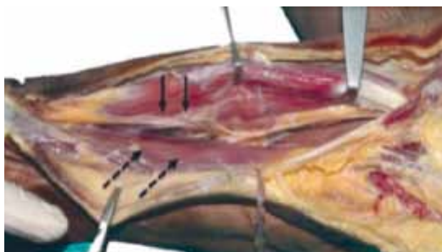
Fig. 2. The anterolateral view of the brachialis muscle (broken arrows) after retraction of the biceps brachii muscle medially exposing the musculocutaneous nerve (solid arrows). [Color figure can be viewed in the online issue, which is available at www.aott.org.tr ]

Since the anterior surface of humerus is the preferred site for MIPO, there are several studies focused on the risks of anterior neurovascular injury during the procedure. [12-14] However, mechanical obstacles on the anterior surface of the humerus, which might be encountered