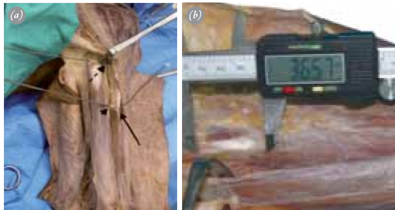
Fig. 4. (a) Proximal (broken arrow) and distal (solid arrow) points of anterior deltoid insertion, and proximal part of brachialis muscle origin (arrow head) were marked with K-wires. (b) Morphometric measurements held by digital calipers. [Color figure can be viewed in the online issue, which is available at www.aott.org.tr ]

anatomy of the muscles and fascicle orientation, the skin and subcutaneous tissue were dissected from the anterior shoulder to the distal elbow. The proximal part of the greater tuberosity and the prominence of the lateral epicondyle were marked with K-wires and the distance between the wires was measured as the humeral length (Fig. 1a). To expose of the brachialis muscle and the musculocutaneous nerve, the interval between the biceps brachii and brachialis was identified, and the biceps brachii was retracted medially (Fig. 2). The deltoid and brachialis muscles were exposed from their origins to insertions with care not to disturb the integrity of the muscles. The distal part of brachialis was then divided longitudinally along its midline to reach the periosteum of the anterior cortex of the humerus. Subsequently, a submuscular extraperiosteal tunnel was prepared between the brachialis muscle and humerus with a periosteal elevator. Then, we performed a retrograde advancement of a 4.5 mm narrow plate through this tunnel to identify which obstacles may interfere with the plate advancement during the MIPO procedure (Fig. 3).