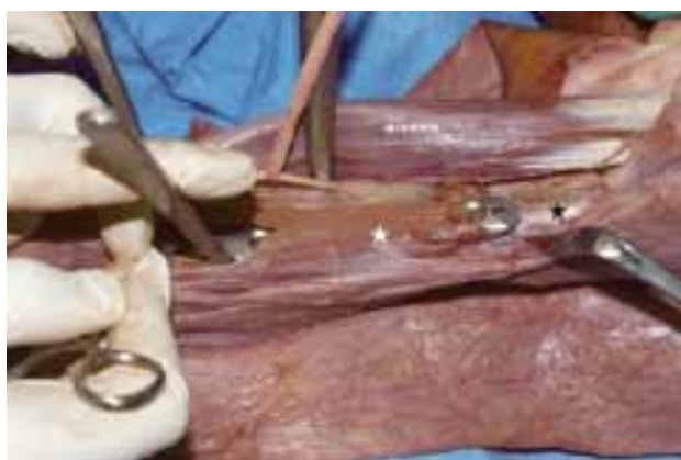
Fig. 3. Subbrachial tunnel through which a 4.5 mm narrow locking plate was advanced retrogradely. Proximal part of brachialis origin (white star) and anterior deltoid insertion (black star) are observed as the main obstacles. [Color figure can be viewed in the online issue, which is available at www.aott.org.tr ]

during the plate advancement, have not been studied previously. We hypothesized that the muscles that attach to the anterior surface are mechanical obstacles that interfere the plate advancement over the anterior surface of humerus during the MIPO procedure. In this study, we aimed to confirm the presence of these obstacles and identify their specific locations.