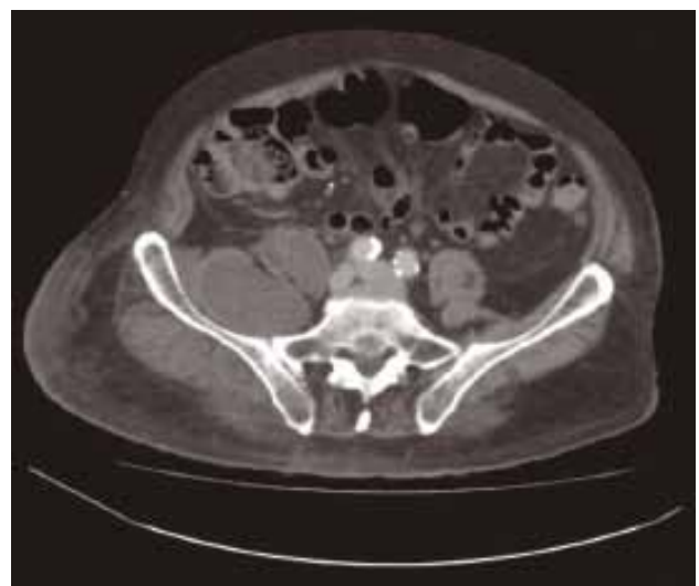
Fig. 2. A CT scan demonstrating a right-sided iliopsoas compartment collection.

The patient underwent a right hip arthrotomy and debridement in the operating theater. While a small pocket of serous fluid was found superficial to the greater