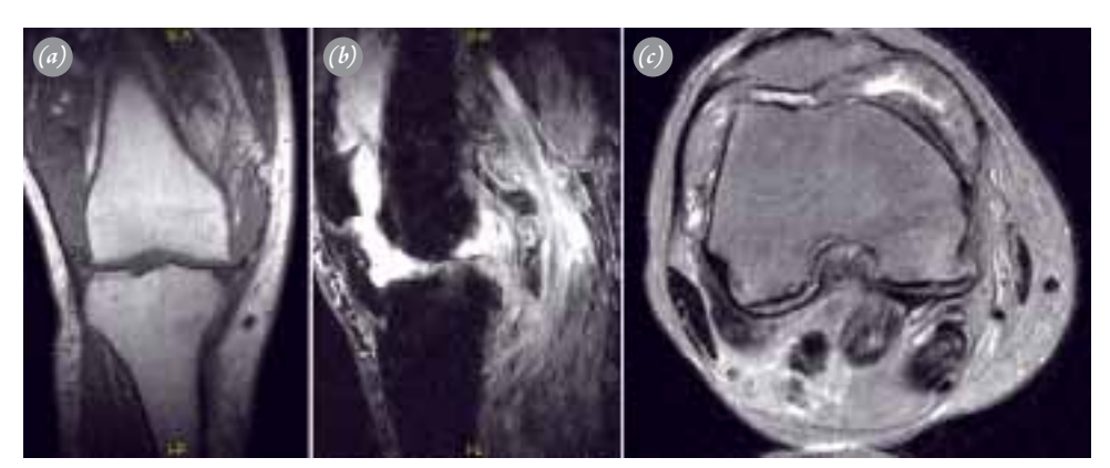
Fig. 2. Magnetic resonance imaging scans of the right knee. (a) Coronal T1 spin-echo, (b) sagittal T2 water-fat separation and (c) axial T2-weighted sequences showing synovial membrane inflammation and hypertrophy. Nodular thickening of the synovium, with a low signal intensity occupying the suprapatellar pouch, can be observed in the T2 images. The areas of very high signal intensity on the T2 sequences correspond to joint fluid.

In the current case, the synovial hypertrophy and hyperplasia detected with the MRI was interpreted as a