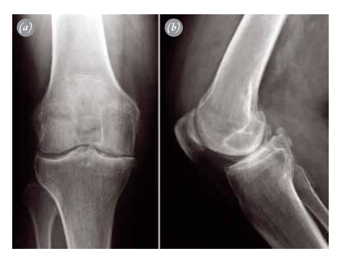
Fig. 1. Preoperative (a) anteroposterior and (b) lateral radiographs of the right knee.

(Fig. 2). This finding was interpreted as a synovial reaction to osteoarthritis.