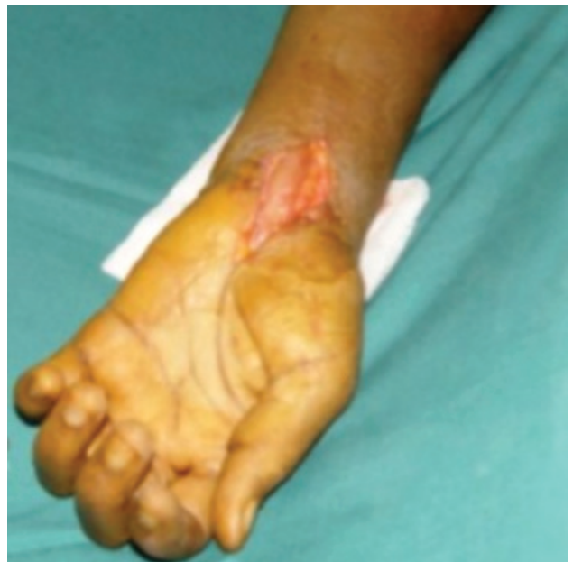
Fig. 2. During surgery there was a fusiform inflammatory swelling around the flexor tendons, without phlegmon formation. There was also swelling on the median nerve. [Color figure can be viewed in the online issue, which is available at www.aott.org.tr ]

The infection of the tendinous sheath by the mycobacterium tuberculosis is a rare form of the extra-pulmonary tuberculosis. This infection of the tendinous sheath frequently occurs on the wrist, the hand, the foot and the ankle. The tuberculous tenosynovitis represents for less than 5% of the cases with musculoskeletal involvement. [4,5] The diagnosis of the tuberculous tenosynovitis may