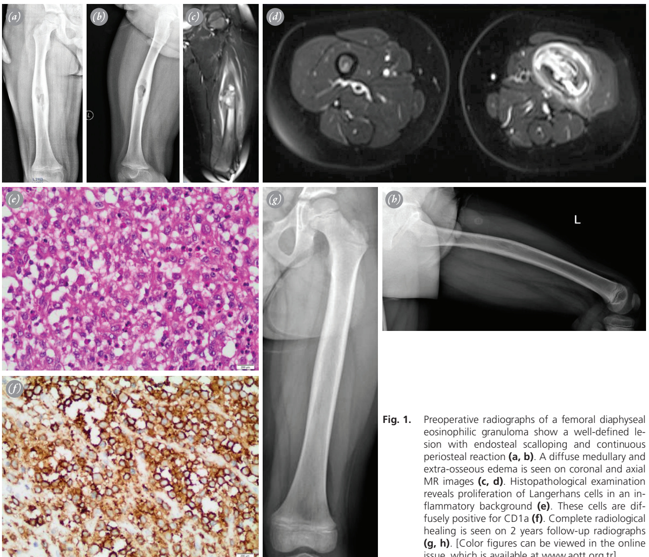
Fig. 1. Preoperative radiographs of a femoral diaphyseal eosinophilic granuloma show a well-defined lesion with endosteal scalloping and continuous periosteal reaction ( a, b ). A diffuse medullary and extra-osseous edema is seen on coronal and axial MR images ( c, d ). Histopathological examination reveals proliferation of Langerhans cells in an inflammatory background ( e ). These cells are diffusely positive for CD1a ( f ). Complete radiological healing is seen on 2 years follow-up radiographs ( g, h ). [Color figures can be viewed in the online issue, which is available at www.aott.org.tr ]

MR imaging demonstrated extensive bone marrow and soft-tissue involvement in the majority of patients. The lesions were hypo- or isointense on T1-weighted images and hyperintense on T2-weighted images. MR images showed cortical destruction and extra-compartmental extension in 3 cases. A diffuse edema in the medullary canal and around the bone was associated with all lesions.