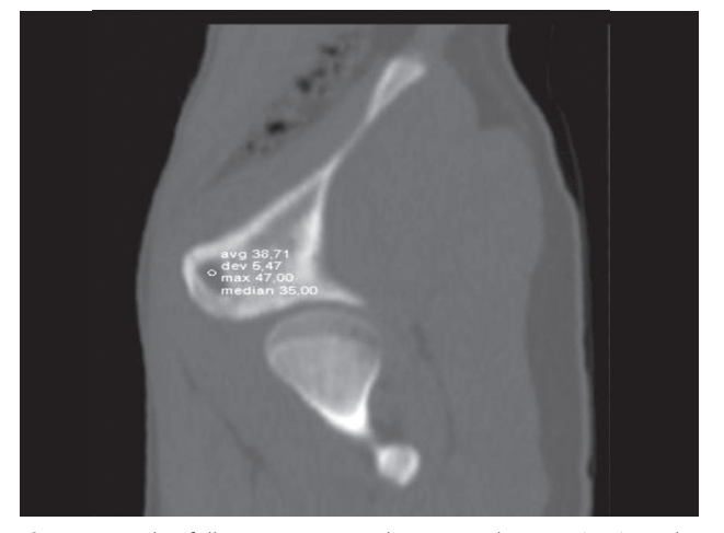
Fig. 4. At the follow-up computed tomography examination, the fracture site density (38 Hounsfield Unit) measurement revealed normal fracture healing.