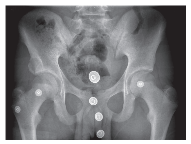
Fig. 1. X-ray examination of the pelvis showing the irregularity at the anterior of the anterior inferior iliac spine.

Plain x-ray and CT images showed a separate osseous fragment within the soft tissues 7 mm adjacent to the right AIIS (Fig. 2a), suggestive of a rectus femoris avulsion fracture. An MRI evaluation was ordered to rule out malignancy and infectious processes (Fig. 3). There were no signs of calcification around the fragment. A regular 8\times25\times16 -mm cyst with peripheral enhancement was noted at the site of fracture (Fig. 2a, 3). These findings were not consistent with simple trauma and suggested a