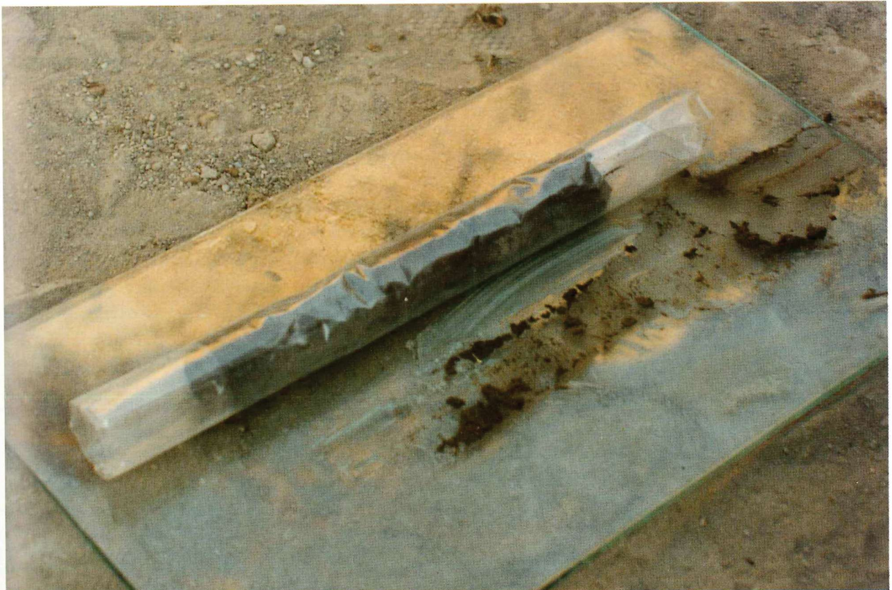
Figure 2: Pollen core sample consolidated by wrapping with plastic