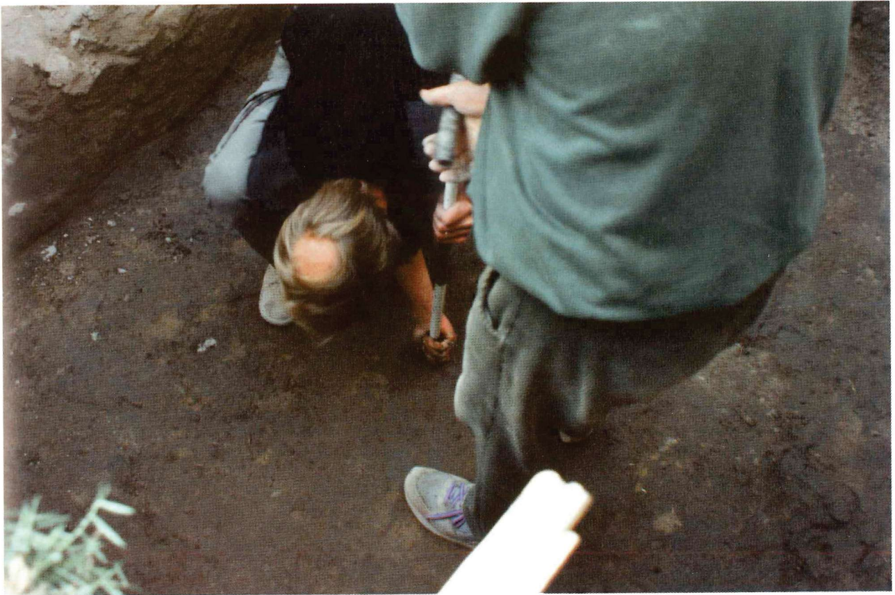
Figure 1: Drilling for pollen sampling at Aşıklı