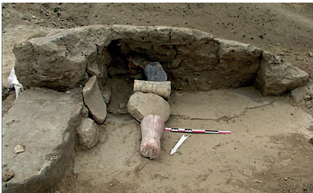
Figure 2: Cenotaph of Ulug Tepe, Southern Turkmenistan / Ulug Tepe'de Anıt Mezar; Güney Türkmenistan Güney Kısım (Lecomte 2013:182).

21, Gonur, Ulug Tepe) and Northeast Iran (Shahrak-e Firouzeh, Chalow). They represent a fairly important funerary custom among the BMAC groups, accounting for about 3.1% of the total burial types at Gonur Depe necropolis (Fig. 1) 10 . In particular, 74 of the total of 2853 graves excavated up to 2007 belong to this type 11 . A single instance was reported from Ulug Tepe (Fig. 2) 12 .