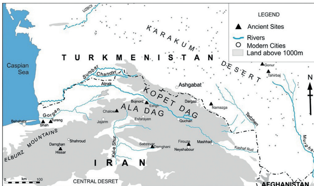
Map 1: Distribution of Settlements of BMAC in the North East of Iran / Iran'ın Kuzeydoğu Bölgesindeki BMAC Yerleşmelerinin Dağılımı (Vahdati, 2014:25).

particularly concerned with memorializing their dead loved ones, and it was for this reason that they built a grave to commemorate them as in they normally did for the other dead members. Their commitment to hold the customary cemetery required by the prevailing tradition is manifest in the placement of burial gifts within the empty grave. Erection of these graves would also offer console to next of kin.