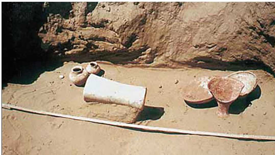
Figure 1: Cenotaph of Gonur Tepe, No. 1230/ Gonur Tepe'de 1230 No'lu Anıt Mezar (Sarianidi 2007:51)