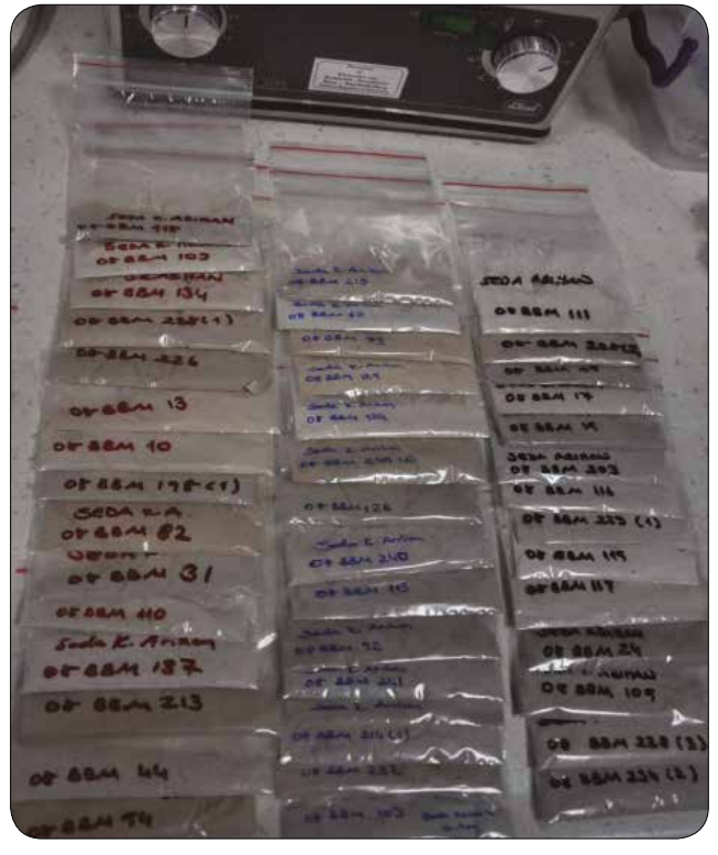
Figure 5: Prepared Samples of Males, Females and Children (Left to Right Respectively) / Hazırlanmış Erkek, Kadın ve Çocuk Örnekleri (Soldan sağa doğru)

Samples were prepared for analysis at Historical Material Research and Conservation Laboratory-MAKLAB at Gazi University (Faculty of Fine Arts, Department of Conservation and Restoration of Cultural Properties). By the suggestions made by Katzenberg and Saunders<sup>52</sup> in sample preparation, our bone samples were processed to make them ready for analysis. Samples were mostly chosen from femoral and humerus head. Contact of samples with metal substances was avoided. All samples taken were washed at ultrasonic bath (Transsonic 470/H) for 10 minutes for each sample with distilled water