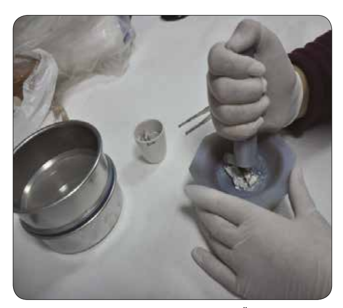
Figur 4: Sample Crushing in Agate Mortar / Örneklerin Agat Havanda Ezilmesi

Samples were prepared for analysis at Historical Material Research and Conservation Laboratory-MAKLAB at Gazi University (Faculty of Fine Arts, Department of Conservation and Restoration of Cultural Properties). By the suggestions made by Katzenberg and Saunders<sup>52</sup> in sample preparation, our bone samples were processed to make them ready for analysis. Samples were mostly chosen from femoral and humerus head. Contact of samples with metal substances was avoided. All samples taken were washed at ultrasonic bath (Transsonic 470/H) for 10 minutes for each sample with distilled water