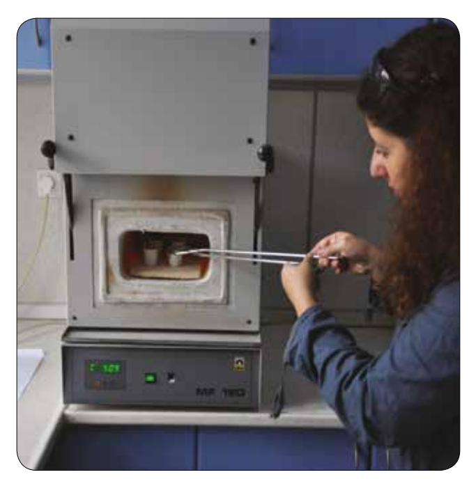
Figure 3: Burning Samples in Stove / Örneklerin Fırında Yakılması