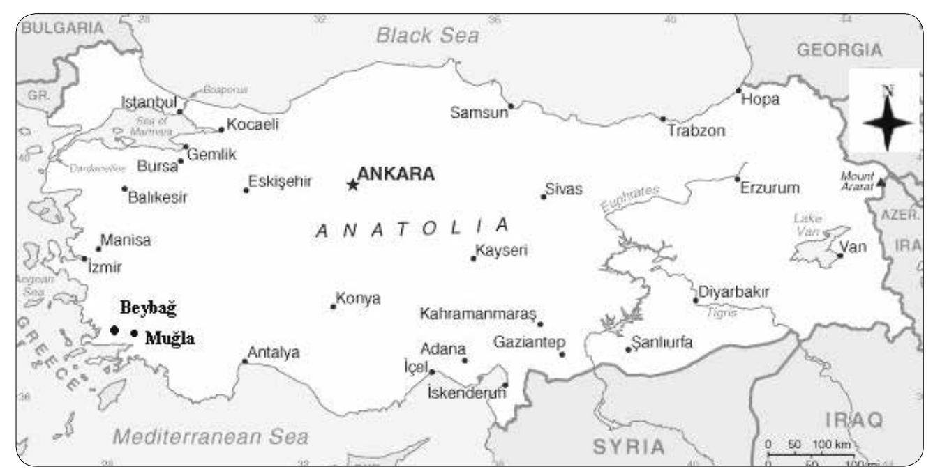
Figure 1: Muğla - Beybağ Region / Muğla Beybağ Bölgesi

property<sup>30</sup>. Also augmented Log Ba/Sr rate in the skeletal material may indicate an augmented marine food in the diet of this human<sup>31</sup>.