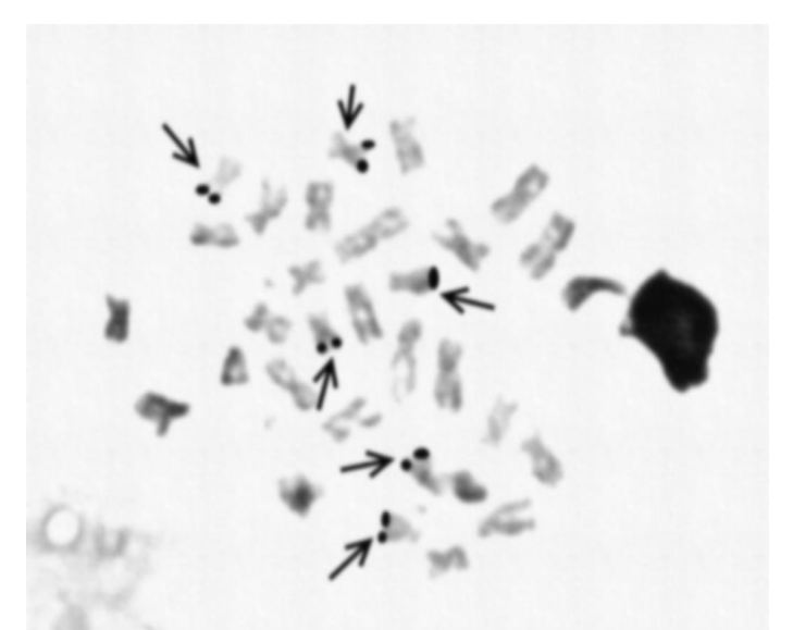
Figure 2. Silver stained metaphase plate of Vulpes vulpes. (Arrows indicate the homomorphic NOR - bearing chromosomes).

regard to various number of the supernumerary B chromosomes in some species (such as red fox, silver fox and racoon dogs), although the fundamental number relatively remained constant [4,7]. Graphodatsky et al. [6] stated that the red fox and its domesticated form, the silver fox, possessed 34 biarmed chromosomes and B chromosomes varied in number. However, the Arctic fox and its domesticated form, the blue fox, possessed a karyotype of 2n=48. The diploid chromosome number and the number of Bs of the specimen from Turkey were in accordance with the conservative karyotype of red fox.