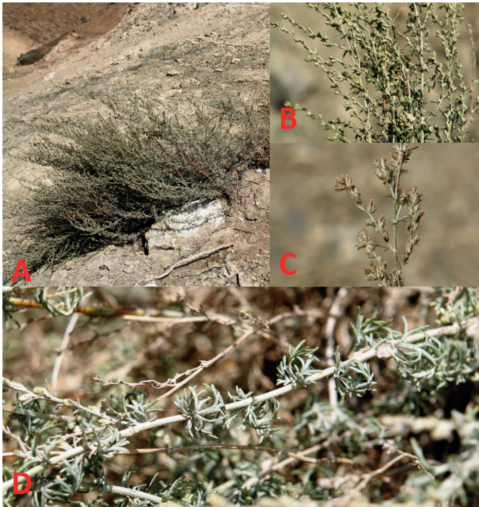
Figure 2. Artemisia oliveriana A. habit and habitat, B-C. General view of the sinflorescence, D. Cauline leaves.