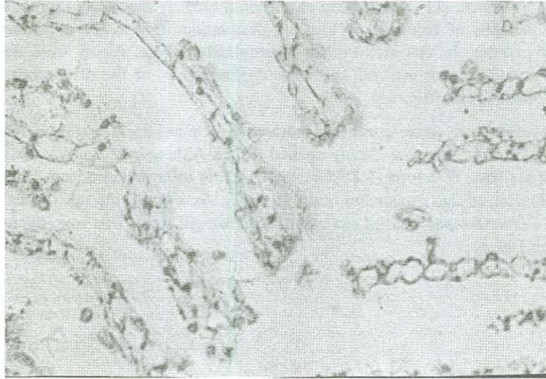
Figure 3. Vacuolar degeneration (arrowed) in the distal ends of the secondary lamellae H+E X 400.