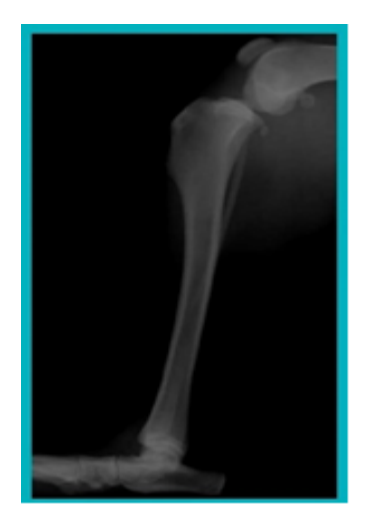
Figure 1. Pre-operative mediolateral radiographic view of the stifle joint on case 8.

the tarsal joint. Craniocaudal radiographs of the stifle joint were also taken. In the pre-operative planning stage, the tibial plateau slope angle of the cases were determined on radiographs and depending on the saw blade (Aesculap<sup>®</sup>, 18, 20, 24, 27, 30 mm, Germany) diameter used, osteotomy of the tibial plateau was performed with the Aesculap Rotation Guide and the extent of rotation was calculated. Following preoperative preparations, anaesthesia induction was carried out by administering Propofol (Propofol, 1%, 200 mg/20 ml, Fresenius, Sweden) at a dose of 6-8 mg/kg intravenous injection and maintained with 2% Isoflurane (Forane, 100 ml, Abbott, United Kingdom) closed circuit inhalation anaesthesia. Pre-operative antibiotherapy of the cases was achieved with IV injection of 20-40 mg/kg Ceftriaxon (Rocephine, 1000 mg/ml, Roche, Switzerland).