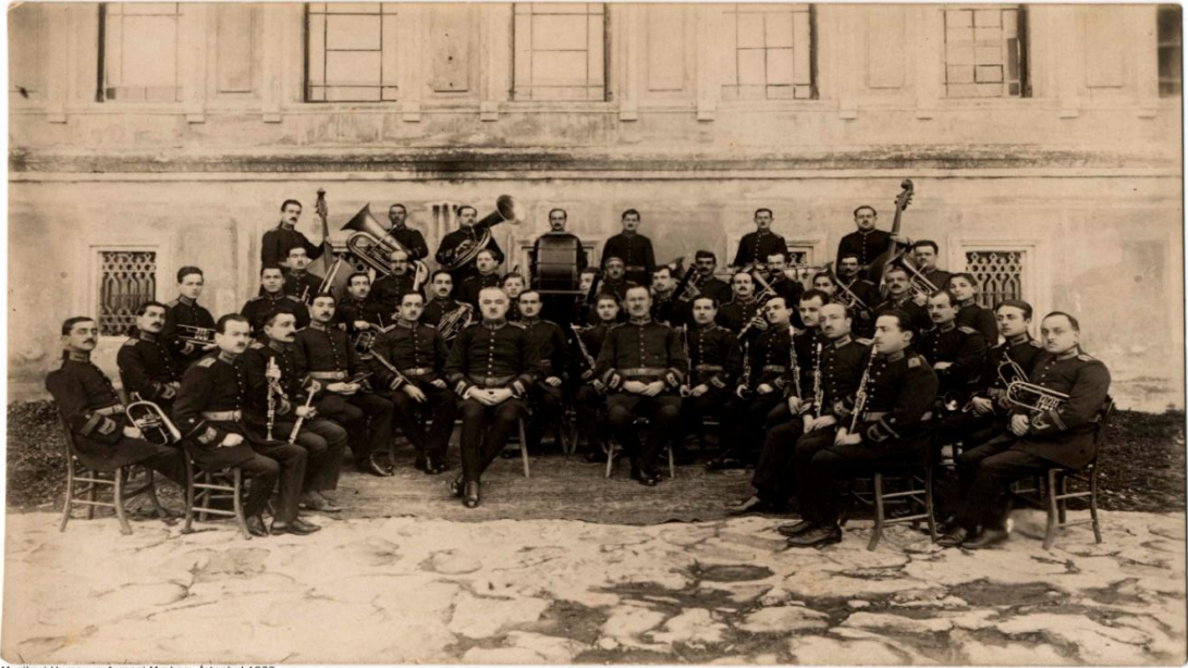
Musika-i Humayun Armoni Mızıkası, İstanbul 1920