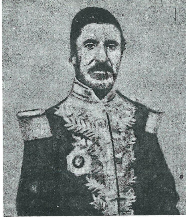
Osman Zeki Üngör