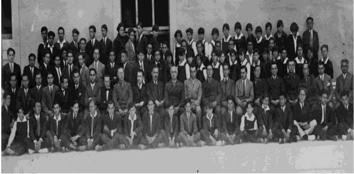
Muallim Mektebi ik kadrosu, 1925