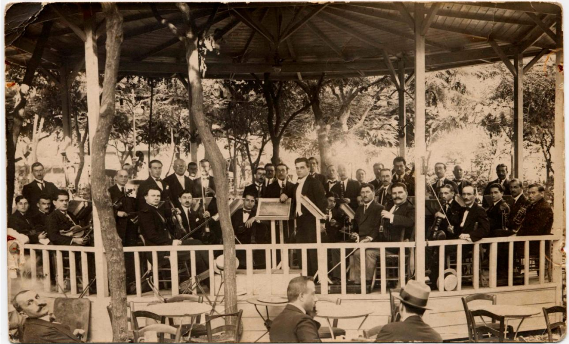
Bahçede Konser, 1919

The Music of Imperial had maintained serving in the period of the Prince (Sultan Reşad or Mehmed the V.th) Mehmed Reşad Efendi who was enthroned after Abdulhamid II. in April 1909. The situation had not changed in the reign of Mehmed Vahidettin's also.