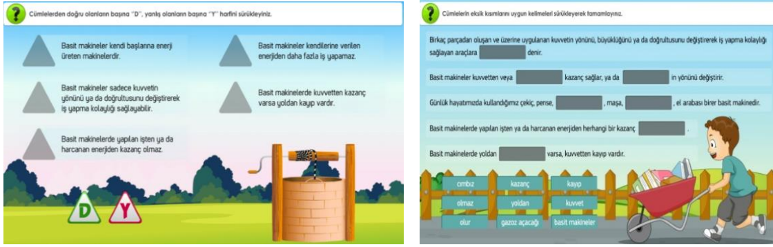
Figure 1 Screenshots of the activities

The activities are arranged in a way that enables the participants to design the lever, pulleys, inclined plane, spinning wheel and ferries wheel (compound machine) materials to support the engineering discipline with simple materials given to them in accordance with the unit topics.