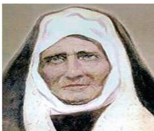
Image 3. Heroine Nene Hatun

An example of this situation is in image 3 (MEB, 2019c, p.118) in the 11th-grade history textbook in the text "Kahraman Nene Hatun at the 93 War" .... Although her husband told her to stay, take care of the child," Nene Hatun entrusted her child to God and joined the crowd... After the Korean War, General Ridgway, a NATO officer in Erzurum, visited Nene Hatun at her home and kissed her hand. "I did my duty at the time," she told Ridgway, who visited her. Today, despite my advanced age, I have the strength and excitement to do the same service in a more perfect way. " once again, she showed the spirit of the heroic Turkish woman " , showing the example of a woman who put the defense of the homeland before her other roles. Considering the general context of the text and the language structure of the text and the picture used, the roles were concretized through exemplary historical figures and stories, starting from the historical background.