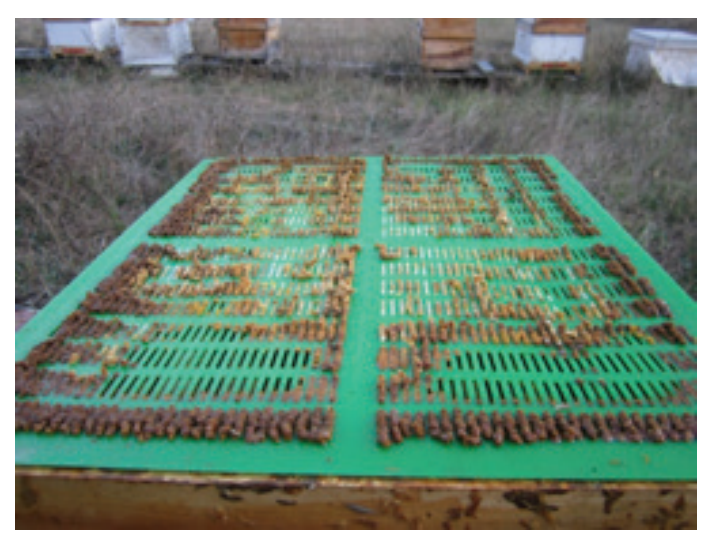
Figure 1. Propolis was collected by plastic trap