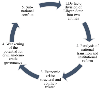
Figure 3: Main manifestations of fragility, conflict and violence in Libya

On the other hand, it is seen that after the intensification of violence, political solutions and stabilization were also sought through conferences such as Palermo and Berlin by external actors. The point to be emphasized here is that even if the parties were in a deadlock, or the intensity of violence increased, the dynamic of the conflict has kept on shifting within itself. At this point, when the general course of the conflict is examined since the Libyan conflict began in 2014, Libya has witnessed a rise in violence, and this has also had destructive effects for all sides. However, in January 2021, the intensity of the conflict was decreased as a result of Haftar repulsion from Tripoli. By mid-2021, the process proceeds to progress under control. Before addressing this part, it is useful to briefly look at the dynamics that are effective at the beginning of the conflict.