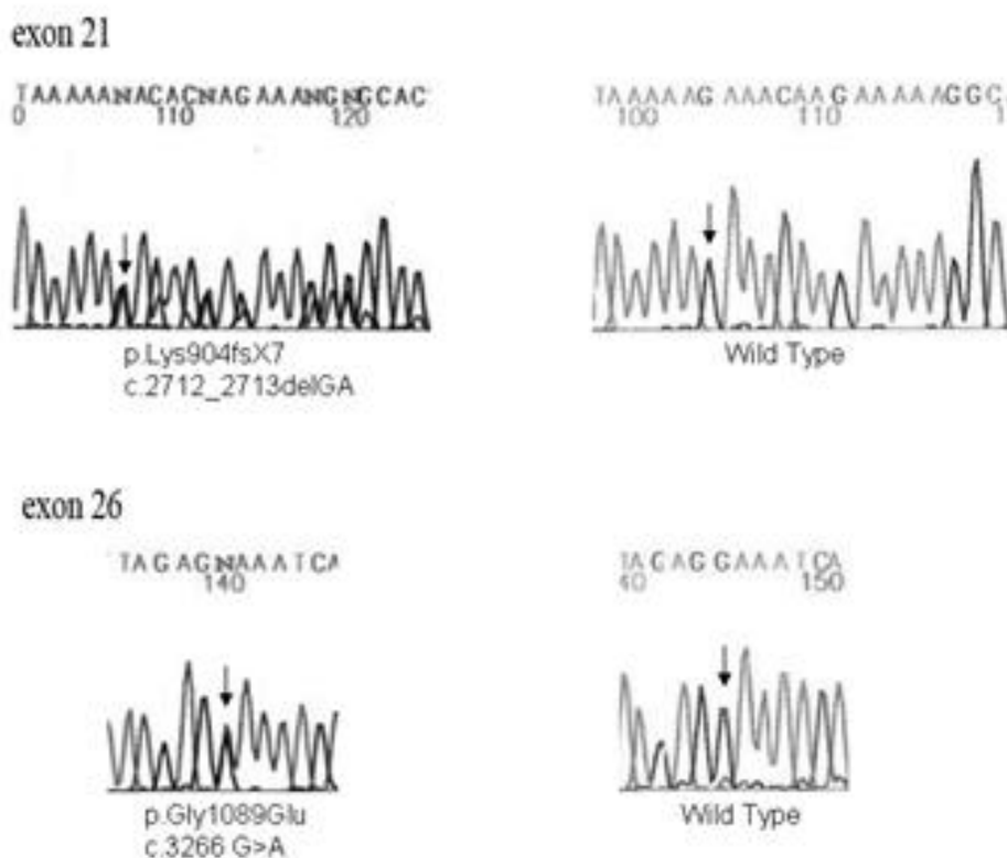
Figure 1- Sequence analysis of the SLC12A1 exon 21 and exon 26 in the patient and in the wild type

On the basis of the clinical and molecular findings, the child was managed symptomatically with a very low potassium supplementation (1mEq/Kg/day) in addition to indomethacin (2 mg/Kg/day) and allopurinol (3mg/kg/day).