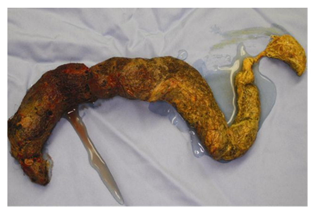
Figure II. showing the 30 cm trichobezoar with a tail.

Figure I. Panel A) Abdominal X-ray showing small bowel dilatation suggestive of obstruction Panel B) Abdominal computer tomography showing foreign body in the terminal ileum (white arrow).