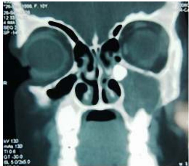
Figure 2: Computed tomography of the paranasal sinuses demonstrated a left well defined circular opacity surrounded by soft tissue mass in the left maxillary antrum in coronal section

Radiological CT study showed a significant hyperdense circular opacity enclosed with fine borders, at a dimension of 1 x 1 cm, located at the left OMC, accompanied with a cystic expansion at the soft tissue density which filled the left maxillary sinus. The coronal and axial cross-sections of the mucocele which occurred because of this obstructive hyperdense mass demonstrated a defect at the medial, anterior and posterior bone walls and also completely blocked the nasal air passage by expanding the medial maxillary wall towards the septum (Figure 2).